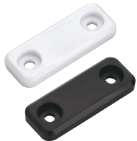
Sealed Magnetic Catches MC-JM45, MC-JM50