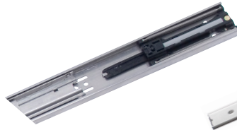
Full Ext. Stainless Steel Soft-Close Slides ESR-SC4513