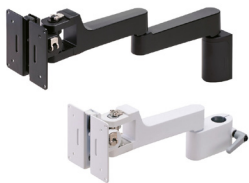
Monitor Arms KA-T100S50 Series