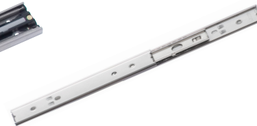
Full Ext. Stainless Steel Mini Slides SCR3 Series