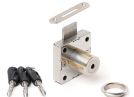
High Security Cabinet Cylinder Locks 7110-24-DN