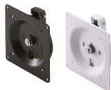
Rotation Brackets KA-T100S50-PMT