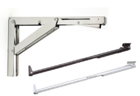
Folding Brackets EB-303, 388 Series