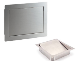
Multi-Purpose Chutes AZ-GD310, AD-KH028-HL