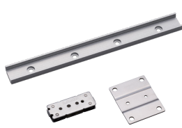
Multi-Roller Linear Guide MLG20, MLG-20C, MLG-20-P55-40