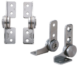
Torque Hinges HG-TA, HG-TB