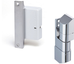
Soft-Close Hinges HG-JV65-U (Concealed), HG-JG150 (Gravity)