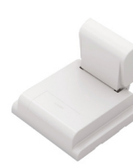
Lift-Assist Hinges HG-PA Series