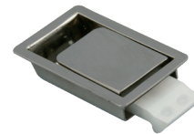
Slam Latches (Flush) LC-48, LC-65A