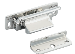
Stainless Steel Lever Latches LL-66S