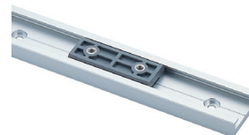
Glide Systems MRS Series