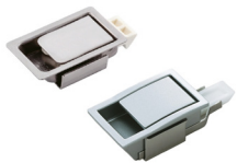
Flush Slam Latches LC-48, LC-65