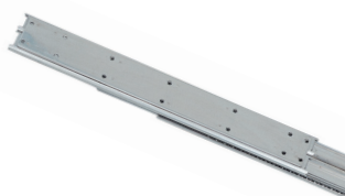
Full Extension Slides ESR-10