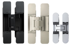
Concealed Hinges HES3D Series