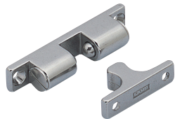
Tension Catches BCTS