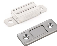
Magnetic Catches MC-159, MC-YN005