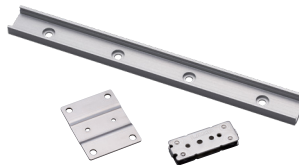
Multi-Roller Linears MLG20, MLG-20C, MLG-20-P55-40