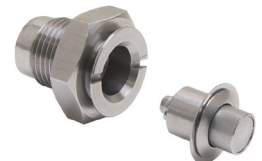
Stainless Steel Push Lock Fastener 152FT