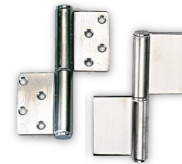
Lift Off Hinge S-6173-5, S-6166-6