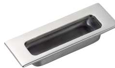
Recessed Pulls HH-KS, HH-DS, HH-K