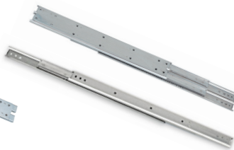
Full Extension Slides ESR-6 Series, ESR-10 Series, ESR-SC4513, ESR-DC4513