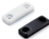
Counter Plate MC-JMP