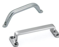
Stainless Steel Handles MG, FT-T