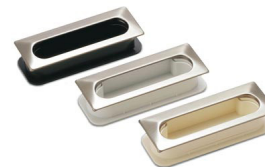
Recessed Pulls UTA-105