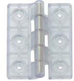
Butt Hinges HG-P100