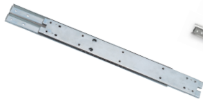
3/4 Extension Slides ESR-5 Series