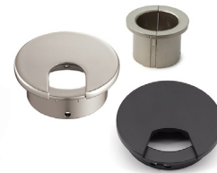
Grommets LS60F, CHC-S, LS-50S-S