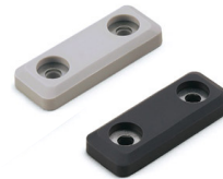
Sealed Mag. Catches MC-MS