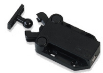
Non-Magnetic Touch Latch MC-37